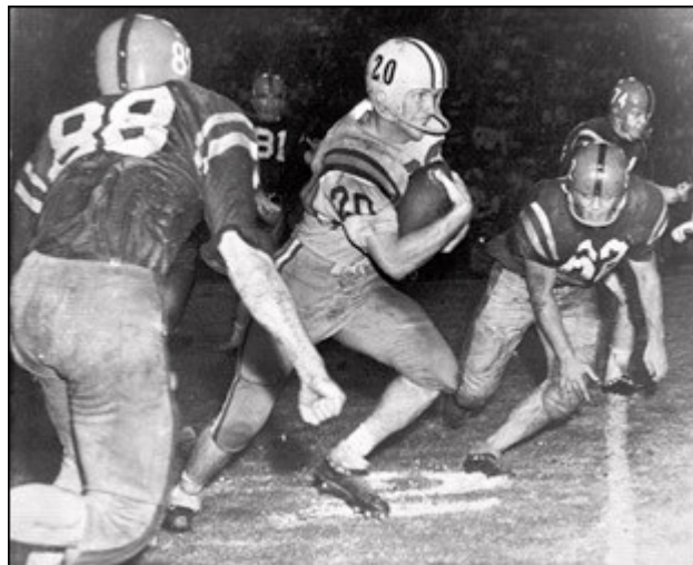
LSU's Billy Cannon was one of the greatest players in college football history and remained revered in Baton Rouge later in life.