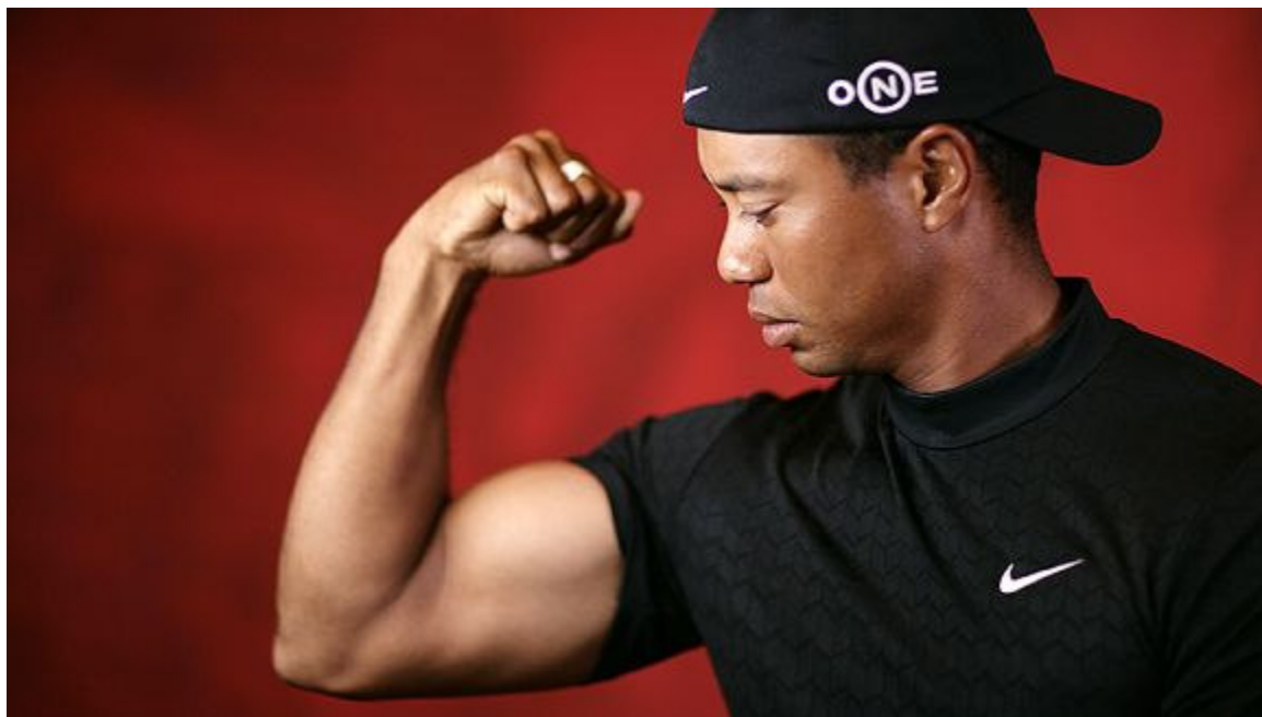
Tiger flexed his muscle with seven PGA Tour victories during the 2007 season.

Sure, he was only fulfilling a corporate obligation with 24 people who had won a day of golf with him through an equipment-company promotion. But as he stood on the